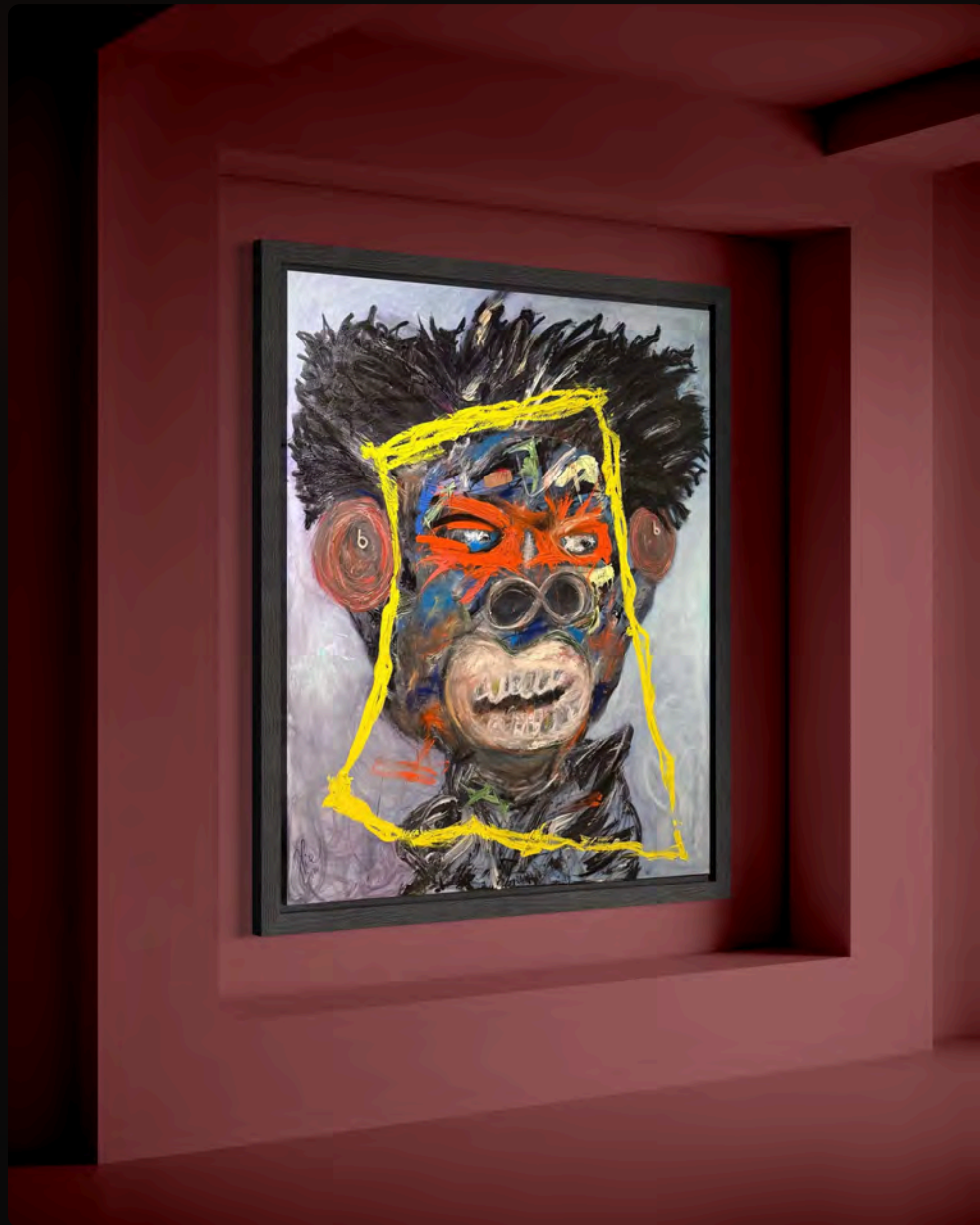
"Bell of Discernment"