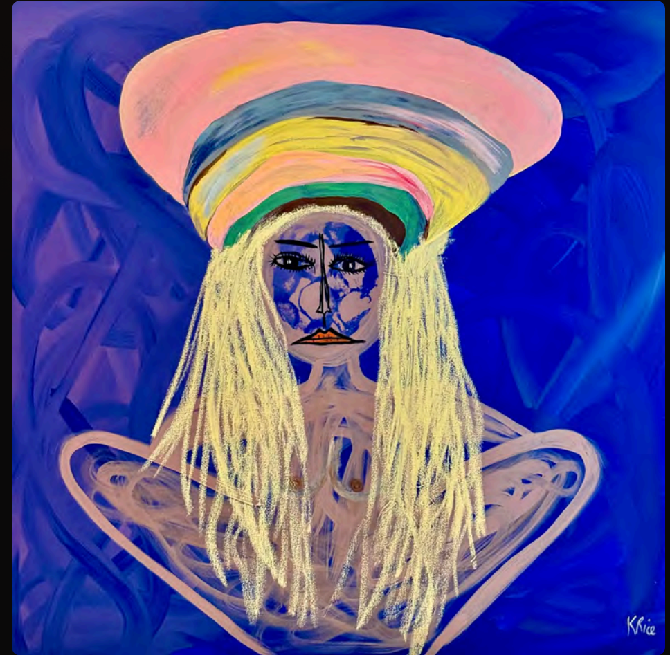
"Tuned In - Tapped In"