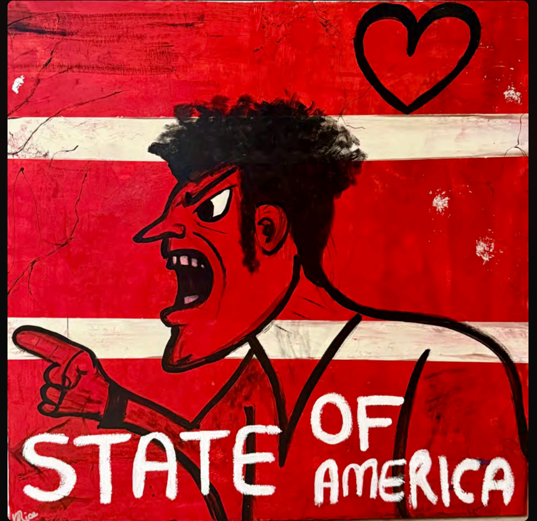
"Divided We Fall"