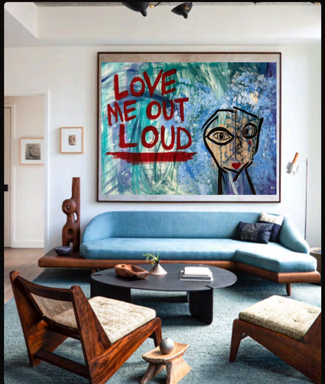
"Not In Secret"