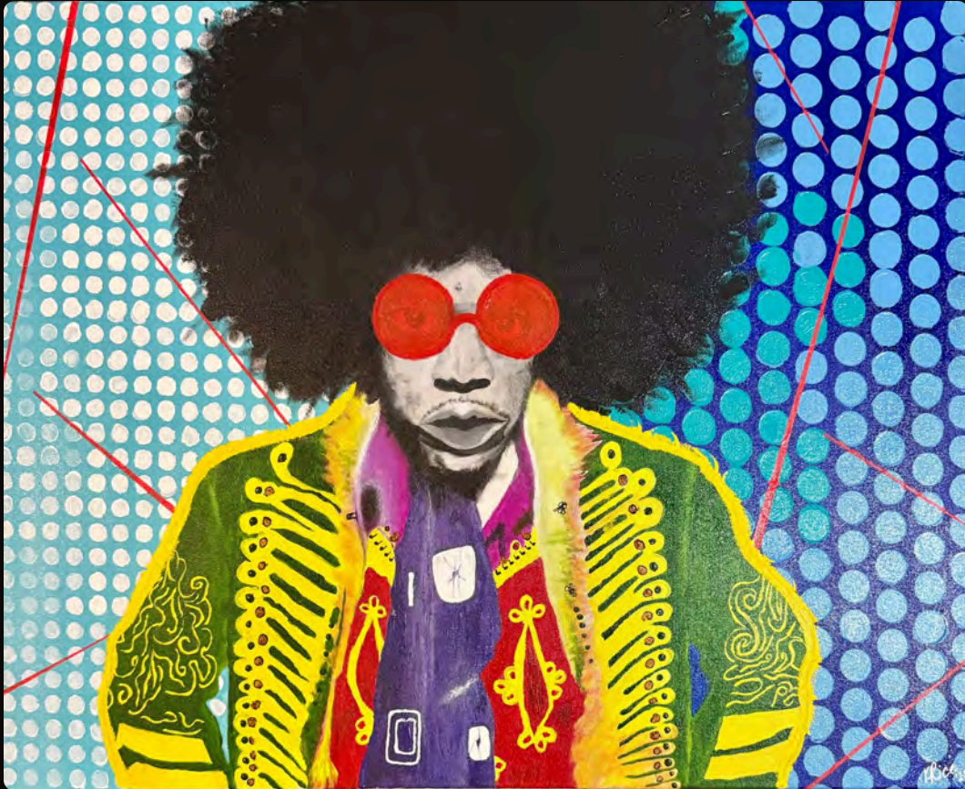
"Guitars and Hussars"