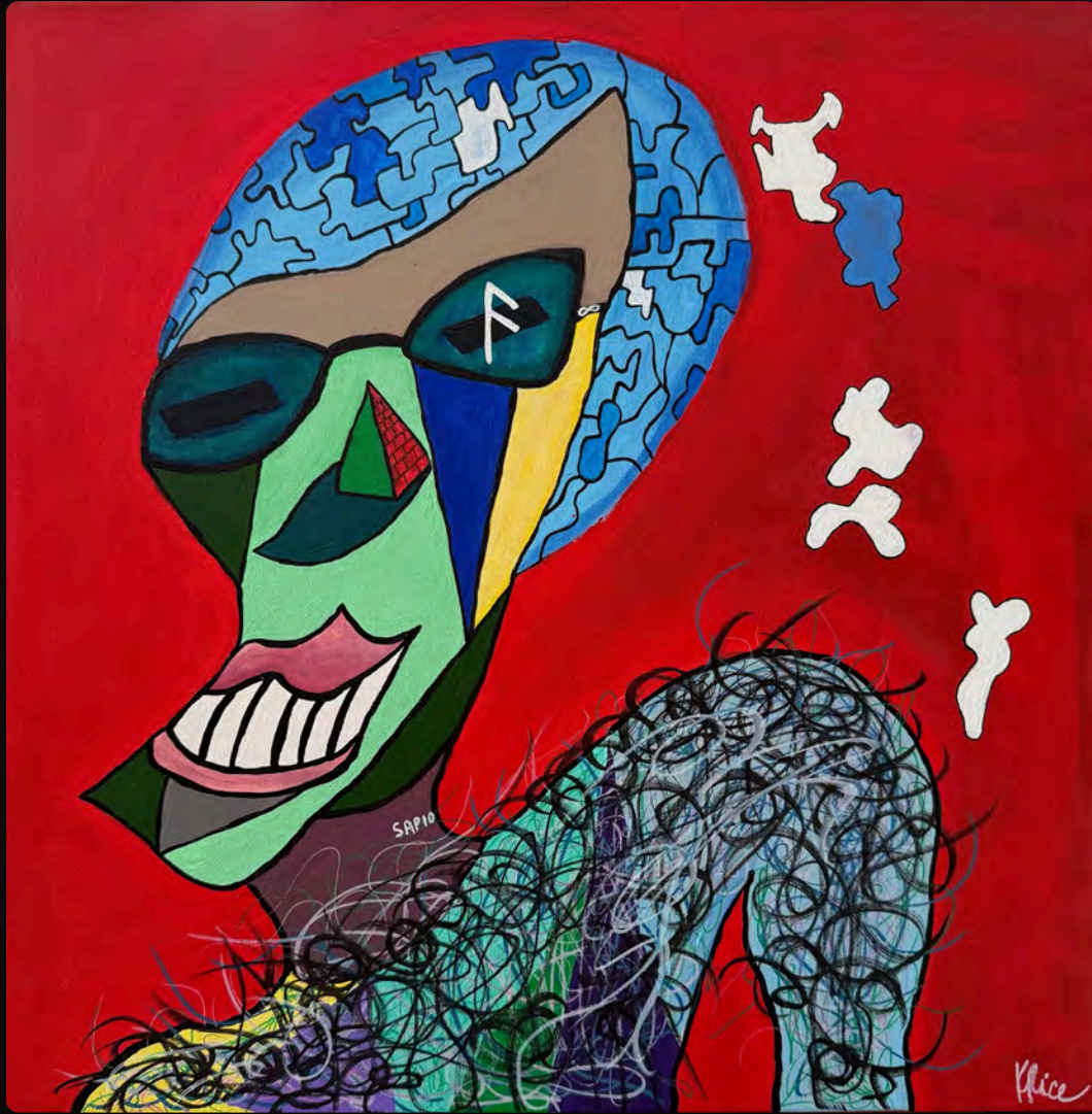
"The Sapio Effect"